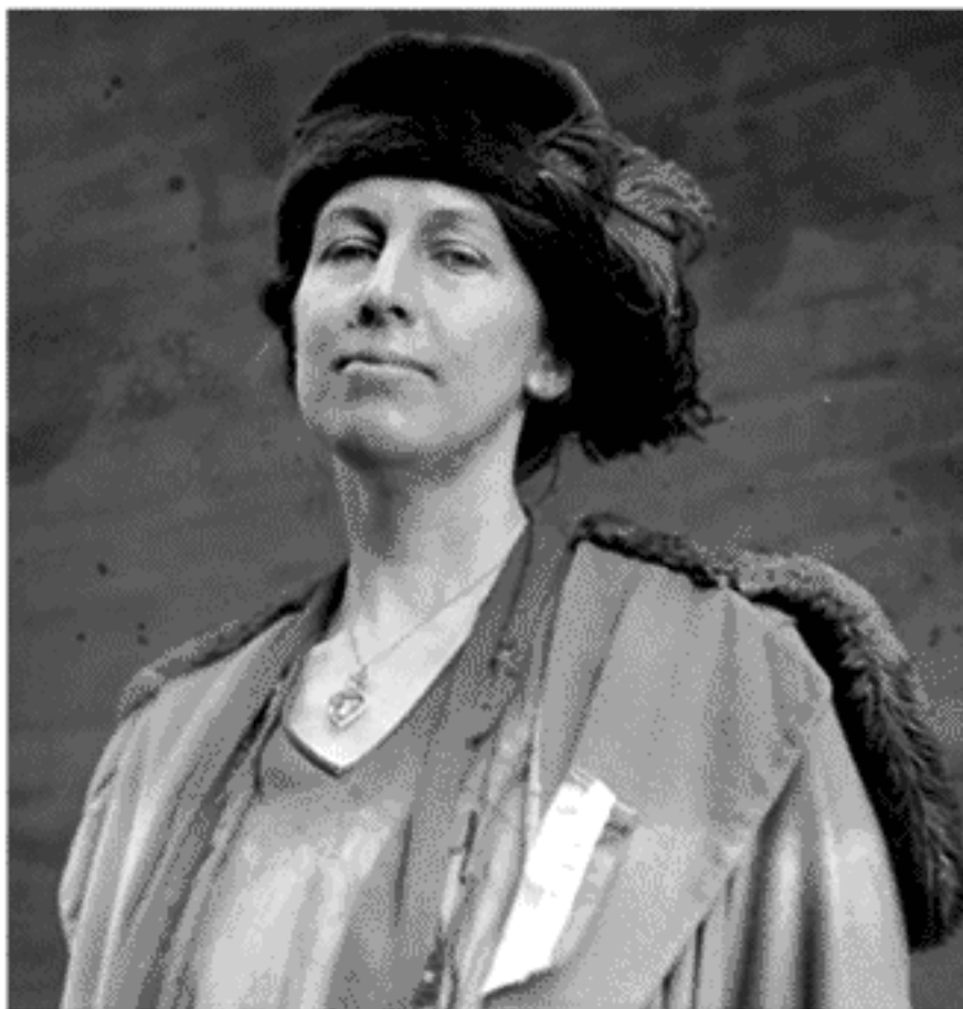
Nora Stanton Blatch Deforest Barney

The New York City Department of Environmental Protection (DEP) announced that it will pay tribute to a trailblazing engineer and civil rights activist by naming one of the world's most advanced tunnel boring machines in her honor. (Contd. Pg. 4)