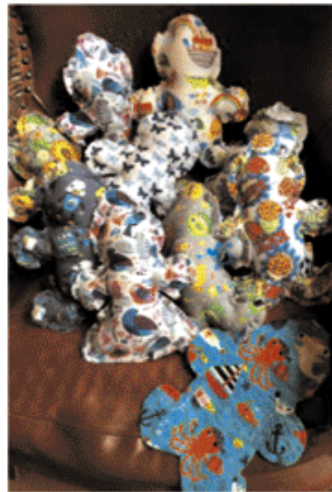
My Friend Rag Dolls

My goal is to help and comfort hundreds of children by donating My Friend Rag Dolls to local hospitals, charities and other organizations whose mission is to support and help children. Since I began two years ago, I have personally sewn and donated over 2000 dolls to hospitals, charities and other organizations that help and support children. The reactions by children and their caregivers are positively overwhelming and have tremendous impact on the lives of the children who have received them."