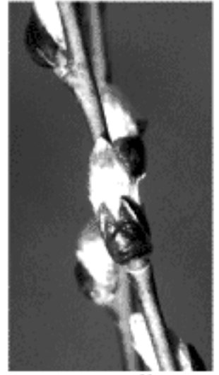
Pussy Willow buds with bud scales

This furry little coat is a catkin, or a tightly bunched arrangement of stamens or carpels. This fur coat will help keep the developing reproductive parts of the Pussy Willow warm through early spring. When the sun shines, the temperature of the center of the catkin can rise above air temperatures by trapping the heat from the sun with its insulating hairs. This additional warming aids in the