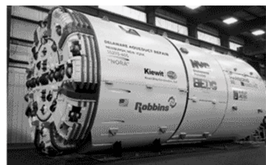
Delaware Aqueduct is 21.6 feet in diameter and weighs 2.7 million pounds.