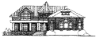
Daniel Pierce Library